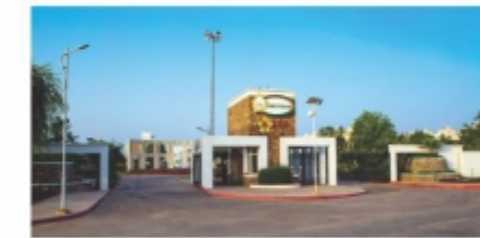
ARG PURAM Agra Road, Jaipur