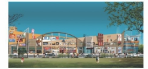
DD CITY MALL MLB Road, Gwalior