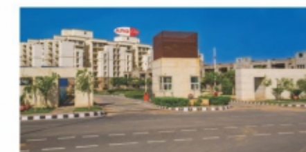
ARG CITY Jaipur Road, Ajmer