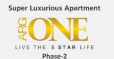
ARG ONE Tonk Road, Near Gopalpura Flyover, Jaipur