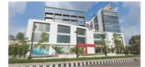
NORTH AVENUE Sikar Road, Jaipur