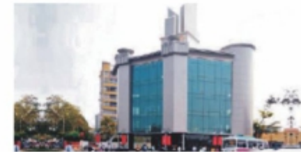
THE METRO Rambagh Circle, Jaipur