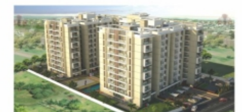
ARG ROYAL ENSIGN Nirwana Garden, Alwar