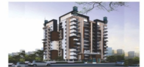
ARG MURLI HEIGHTS, Naibji Ka Bagh, Motidoongri Road, Tilak Nagar, Jaipur