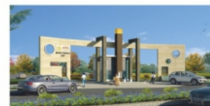
ARG ROYAL ENSIGN CITY Near NIET College, Jaipur