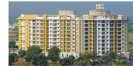
DIVINE ENCLAVE Ajmer Road, Jaipur