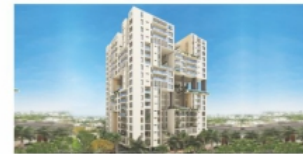
Argus (ARG ONE) Tonk Road, Near Gopalpura Flyover, Jaipur