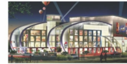
CITY MALL Jhalawar Road, Kota