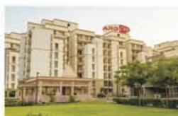
ARG CITY Jaipur Road, Ajmer