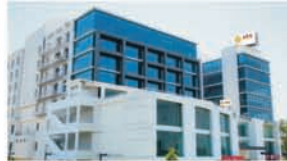
NORTH AVENUE Sikar Road, Jaipur