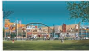
DD CITY MALL MLB Road, Gwalior