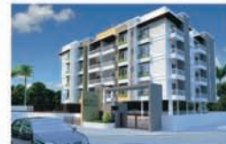
JUGAL ENCLAVE Bani Park, Jaipur