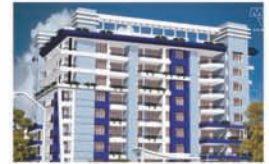
MADHAV VILAS Bani Park, Jaipur