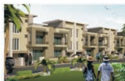
ROSEWOOD VILLA Jaipur Road, Ajmer