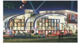
CITY MALL Jhalawar Road, Kota