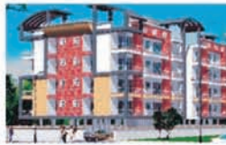
GOVERDHAN KRIPA C-Scheme, Jaipur