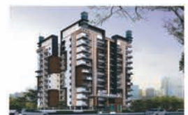
ARG MURLI HEIGHTS Tilak Nagar, Jaipur