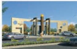
ARG ROYAL ENSIGN CITY Near NIET College, Alwar