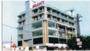
NEELKANTH TOWER Sahkar Circle, Jaipur