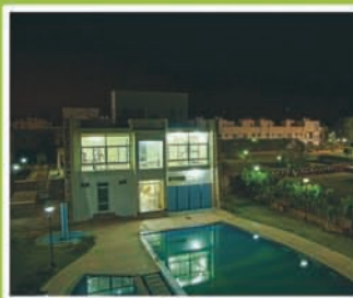
▲ Clubhouse with Swimming Pool