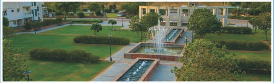
● Landscape & Waterbodies