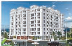
NEELKANTH HEIGHTS Hawa Sarak, Jaipur