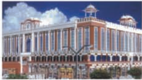
TIME SQUARE Vidhyadhar Nagar, Jaipur