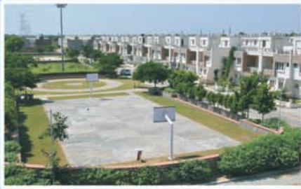
● Basketball Court