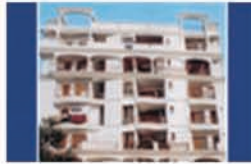
GOLDEN TIMES Vidhyadhar Nagar, Jaipur