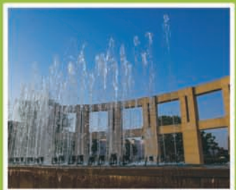
▲ Entrance Waterbody