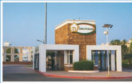
● Main Entrance of the Township