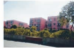
APOLLO APARTMENT Vidhyadhar Nagar, Jaipur