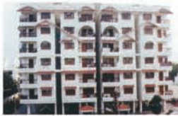
SIDHI VINAYAK Bani Park, Jaipur