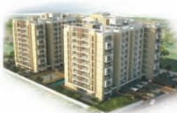
ARG ROYAL ENSIGN Station Road, Alwar