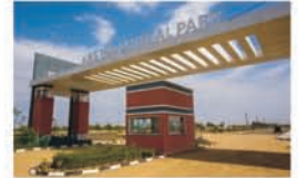
ARG INDUSTRIAL PARK Bagru, Jaipur