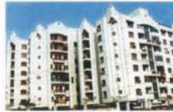
MAHARAJA APARTMENT Bani Park, Jaipur