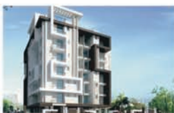
SILVER SPRING Bhankrota, Jaipur