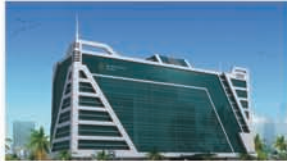
CORPORATE PARK Gopal Bari, Jaipur