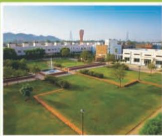
▲ Lush Green Gardens