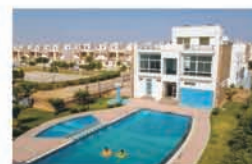
ARG PURAM Agra Road, Jaipur