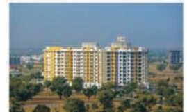
DIVINE ENCLAVE Ajmer Road, Jaipur