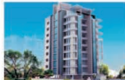
ARUNODAYA Tilak Nagar, Jaipur