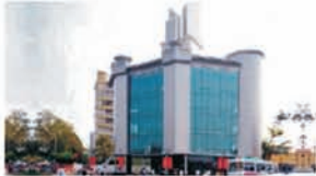
THE METRO Rambagh Circle, Jaipur