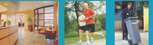
Entrance lobby Jogging track Garbage disposal