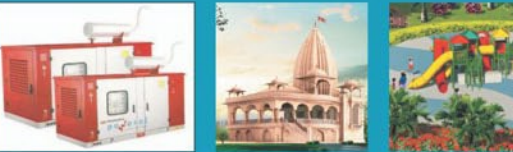
Power backup Temple Children play area